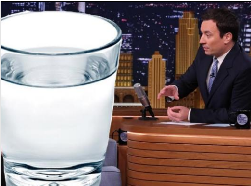
Here I am on the set of the Tonight Show with Jimmy Fallon.

Appearing on the Tonight Show with Jimmy Fallon was a dream come true. Guest spots on national TV are not that common for basic elements like me. In fact, I don't have an agent, a makeup artist, or a support staff, so I jumped into